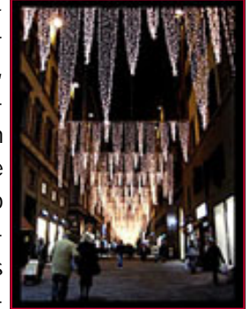
Christmas in Florence

by La Befana, who arrives in the night to fill children's stockings.