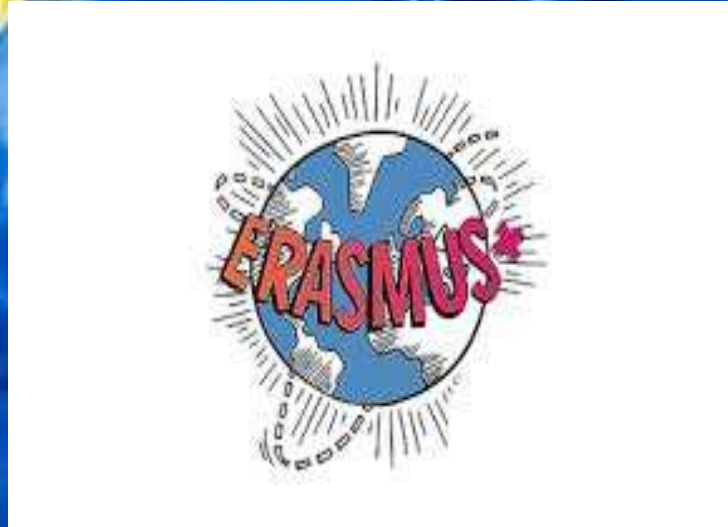
TEODOR PETROV- 9-th grade Foreign Language School - Pleven, Bulgaria