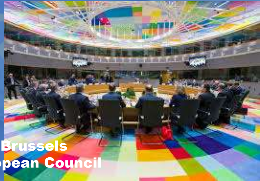
The Brussels European Council

confirmed the conclusion of accession negotiations with Bulgaria and Romania